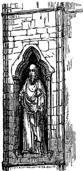
Gateway of the Bishop's Palace, Peterborough, c. 1220.