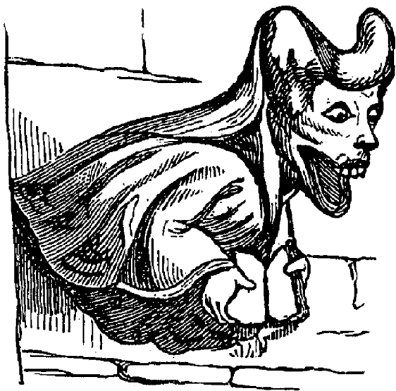
Horsley Church, Derbyshire; circa 1450